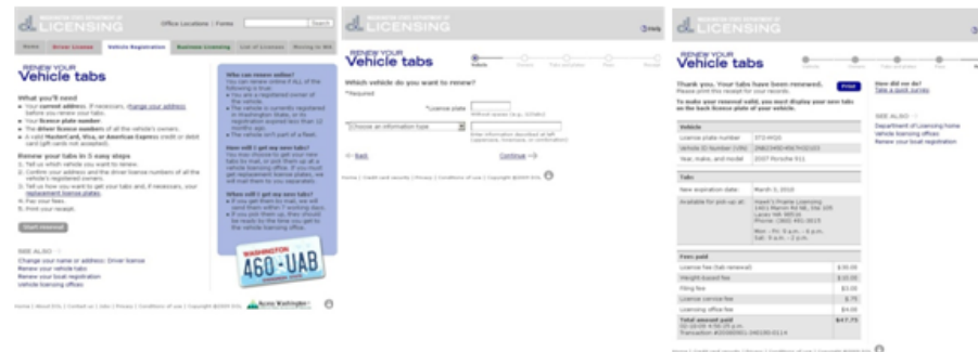
Figure 1. Tab Renewal Start page (left), process step (middle) and last page (right).