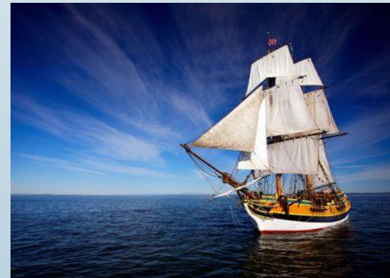
The Lady Washington tall ship